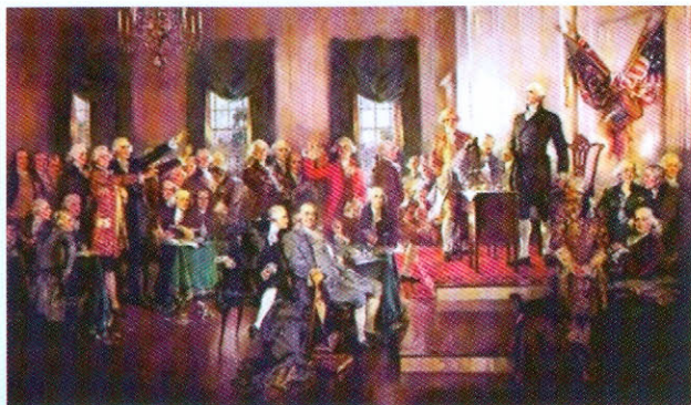
H. Christy's Scene at the Signing of the Constitution