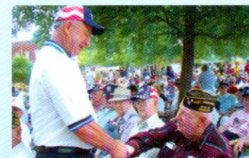
Rep. Jim Guest speaking in Maysville, MO.

This nation was formed to provide its citizens with individual rights and freedoms.